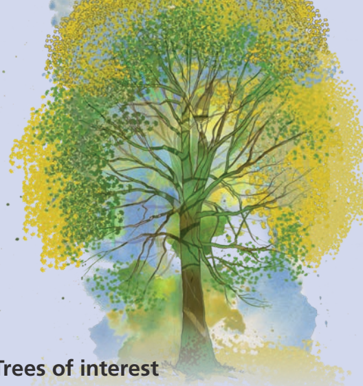
Maidenhair Tree ( Ginkgo biloba )