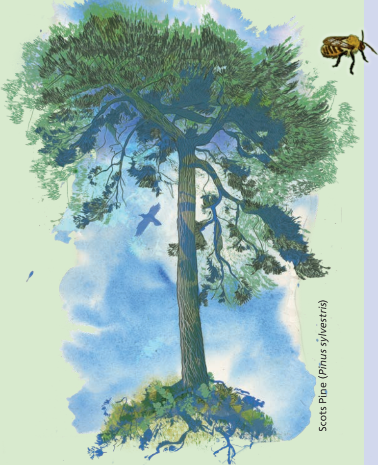
Scots Pine ( Pinus sylvestris )